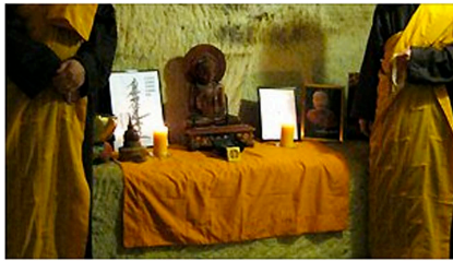
The meditation cave under Nottingham is expected to be open to the public in August

There are about 450 man-made sandstone caves in Nottingham dating back to the medieval period.